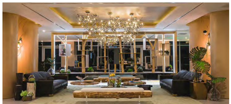
ARIA ON THE BAY