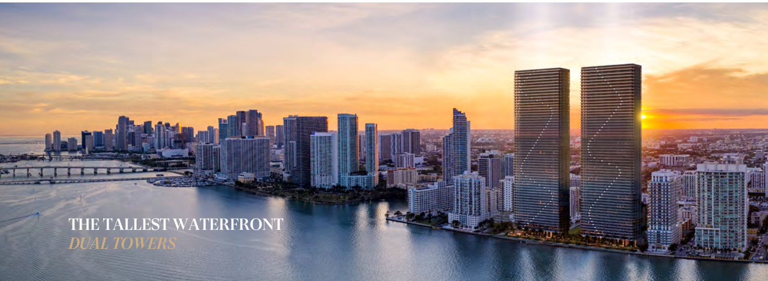
THE TALLEST WATERFRONT DUAL TOWERS