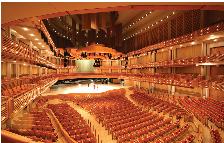
ADRIENNE ARSHT CENTER FOR THE PERFORMING ARTS OF MIAMI

A pair of glass towers with flowing design profiles rises high above Miami's chic Edgewater neighborhood. Directly on the shores of Biscayne Bay and surrounded the bustling Downtown and Brickell city centers, Design District, Wynwood, Midtown, and Miami Beach. Aria Reserve is immediately recognizable, yet feels like a private estate hidden away from the rest of the world.