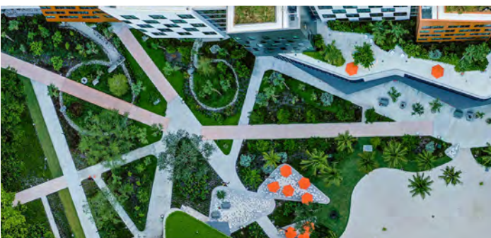
UNIVERSITY OF MIAMI LAKESIDE VILLAGE